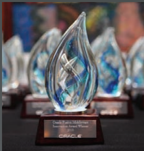
Oracle Portal Blazer & Innovator Awards Recipient

Exalogic Elastic Cloud Oracle Exadata Oracle GoldenGate Oracle E-Business Suite Financial Mgt Oracle E-Business Suite Supply Chain Mgt Oracle Business Intelligence Oracle Service-Oriented Architecture Oracle Wholesale Distribution Industry Oracle Healthcare Industry SPARC T4-Based Servers Oracle Business Intelligence Applications Oracle Database Appliance Oracle Solaris 10 Sun ZFS Storage Appliance Oracle Application Grid Oracle WebCenter Portal Oracle Database 11g Security Oracle Enterprise Manager Oracle Real Application Clusters Oracle Database Performance Tuning Data Warehousing Oracle Database Oracle Linux